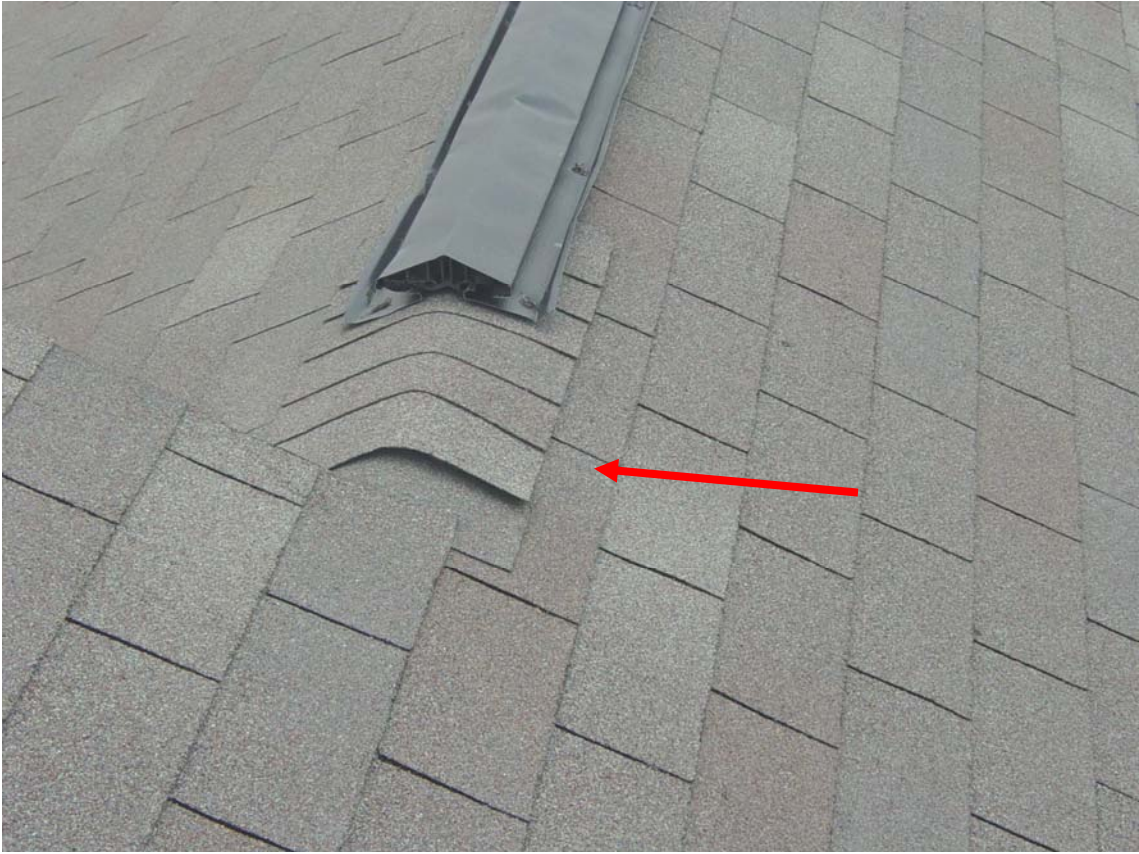
Loose ridge shingles