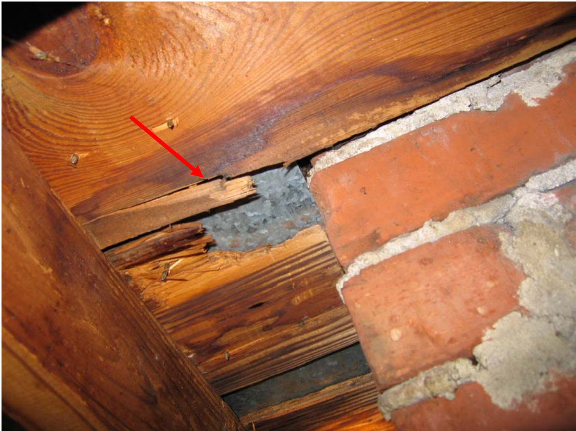
Damaged roof timbers from homeowner roof repairs