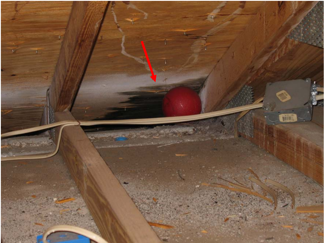
Water staining caused by failed homeowner repairs to roof shingles