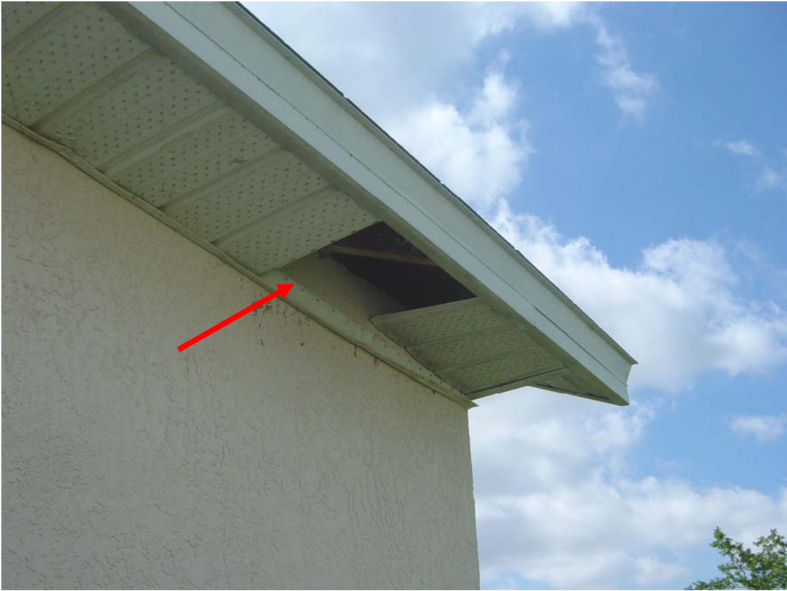
Damaged eave ventilators