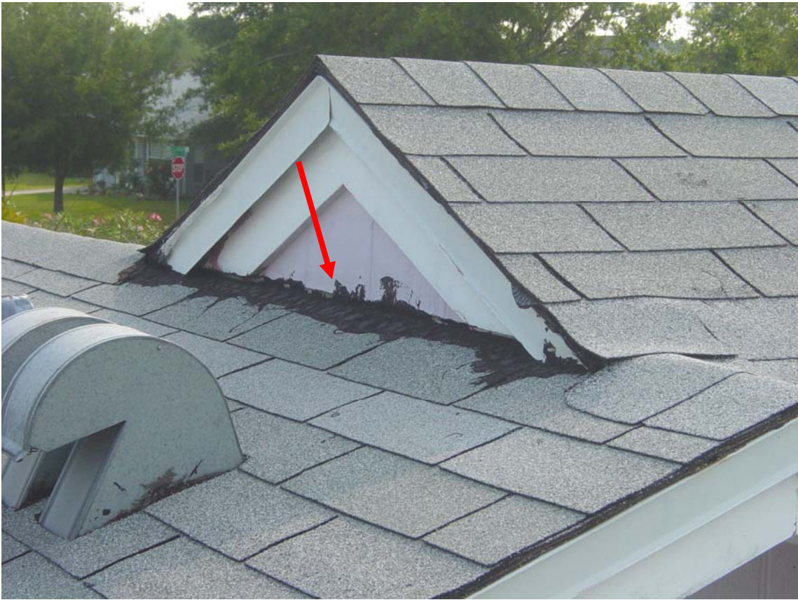
Handyman homeowner repairs