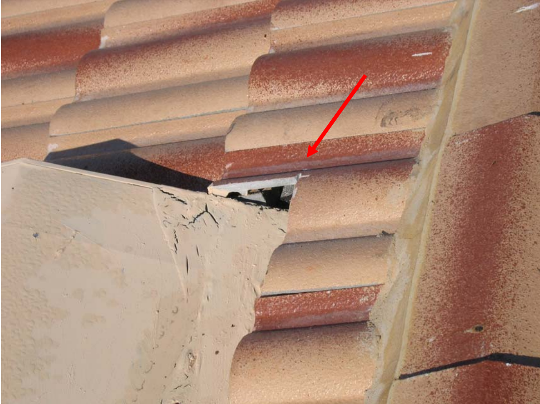
Badly cut roof tiles allowing water penetration

All these defects have been found in brand new construction and resale homes.