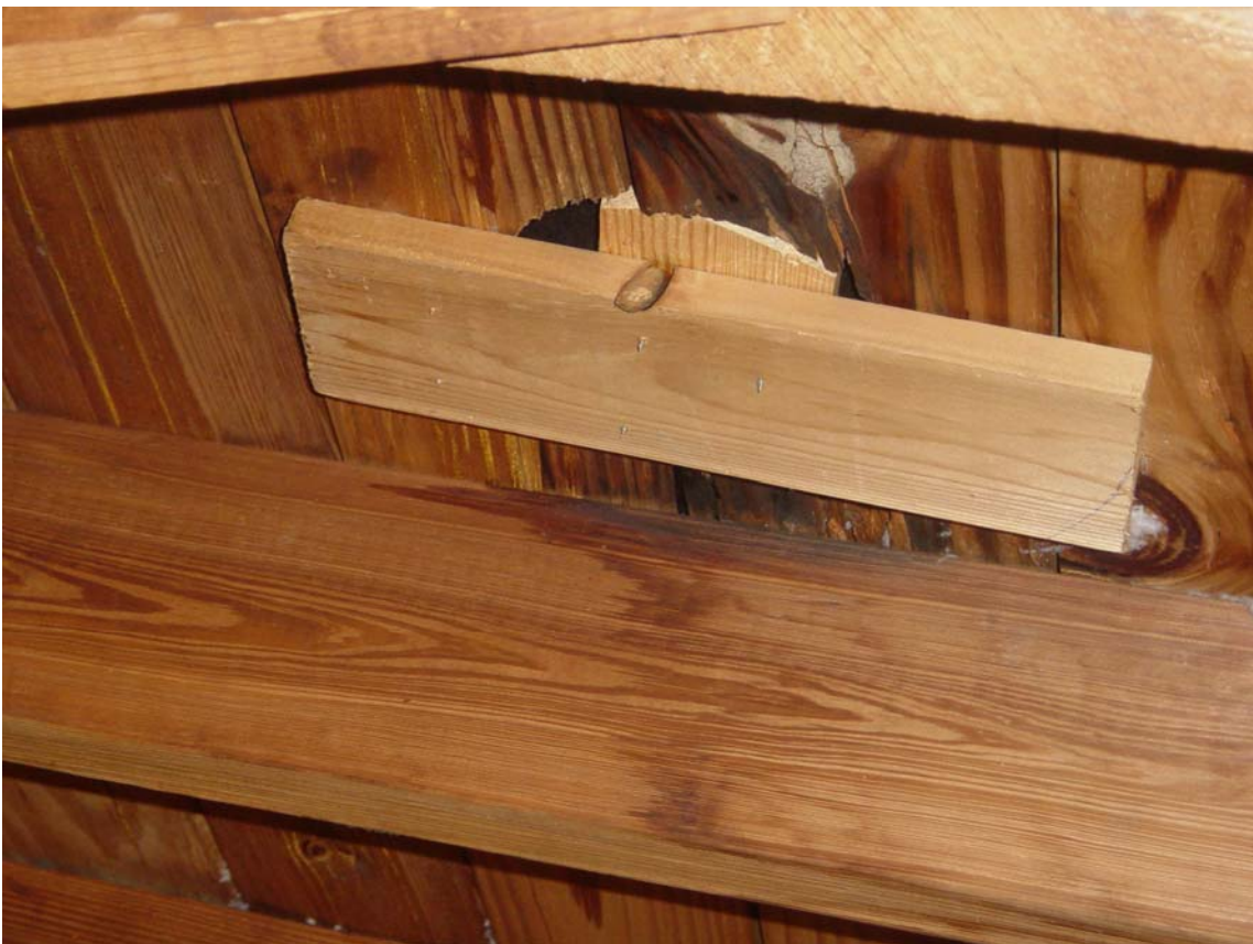
Homeowner roof repair