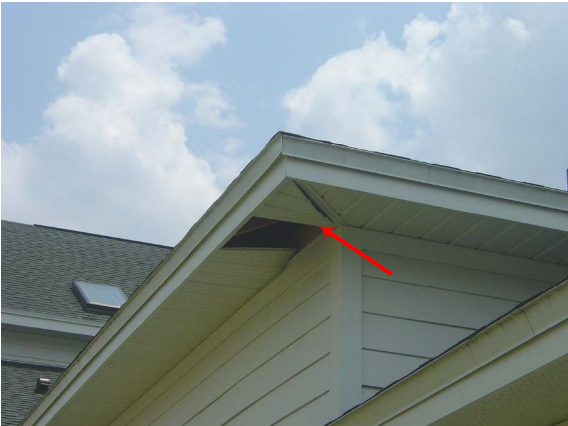
Damaged eave ventilators