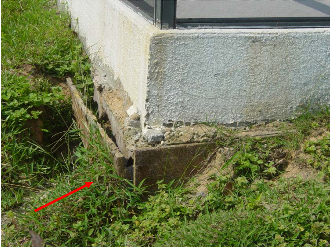
Soil erosion causing foundation failure

All these defects have been found in brand new construction and resale homes.