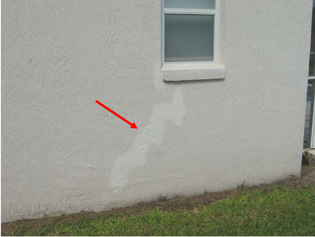
Stepped cracking on exterior wall from ground settlement