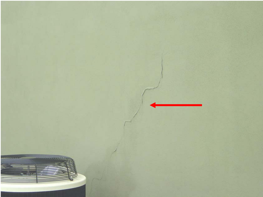
Stepped cracking on exterior wall from ground settlement