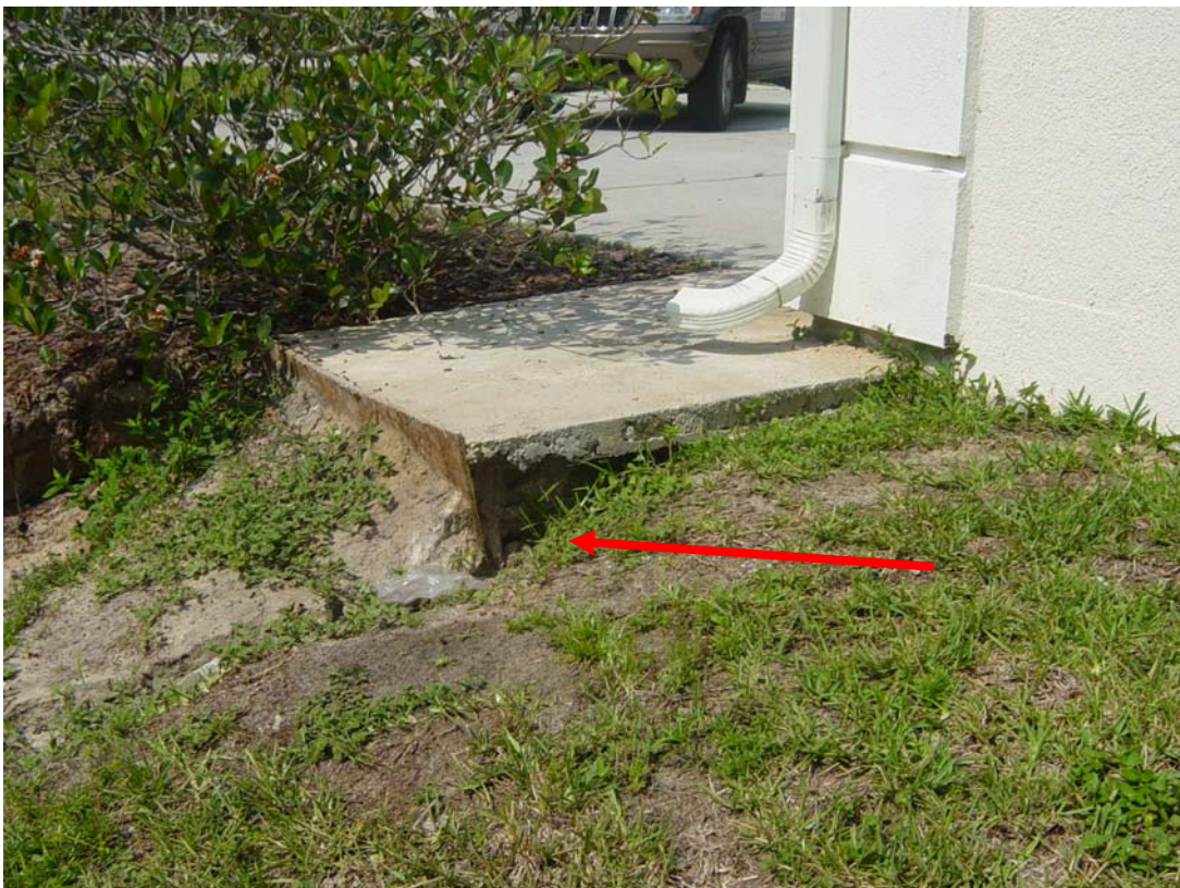
Soil erosion causing foundation failure